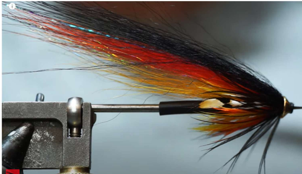
Willie Gunn – on plastic tubes with conehead