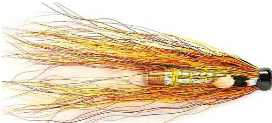
Silver Body Willie Gunn (Good for clear water rivers)